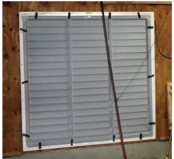
Example of EcoTight Shutter with Clips in a Building